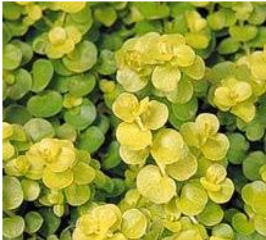
4" Lysimachia O-54652-10210-0