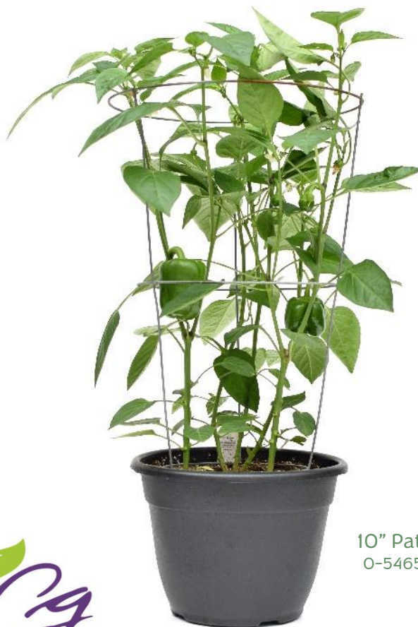
10" Patio Pepper O-54652-10814-0