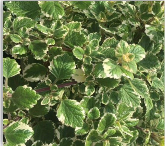
4" Iboza (Plectranthus) O-54652-10802-7