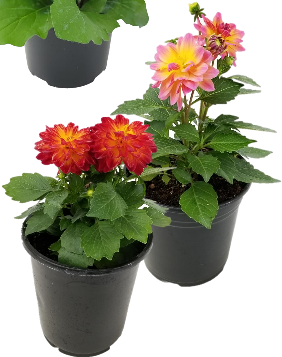
1 Gallon Premium Annuals 0-54652-10623-8