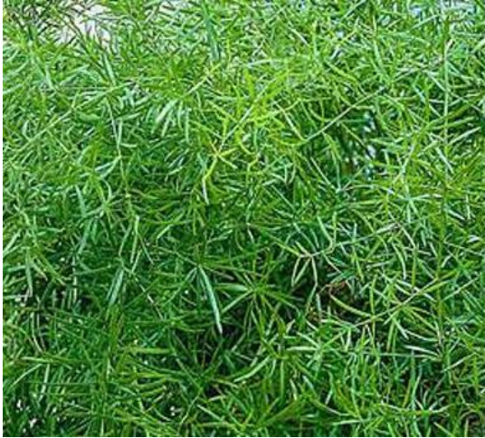
4" Asparagus Sprengeri Fern O-54652-10799-0