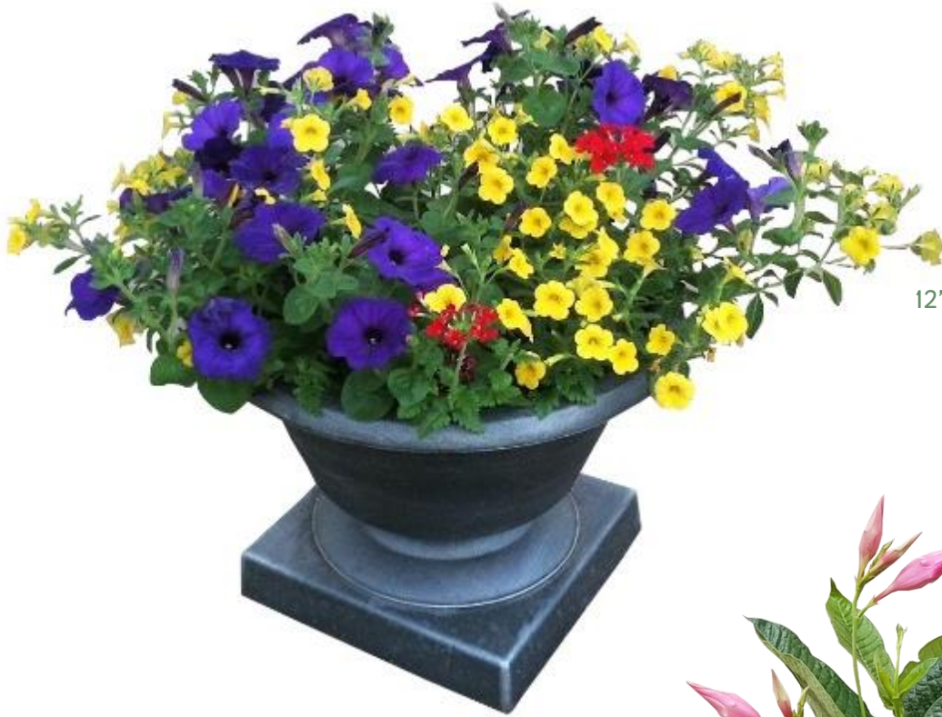
12" Combination Urn Planter 0-54652-99677-8