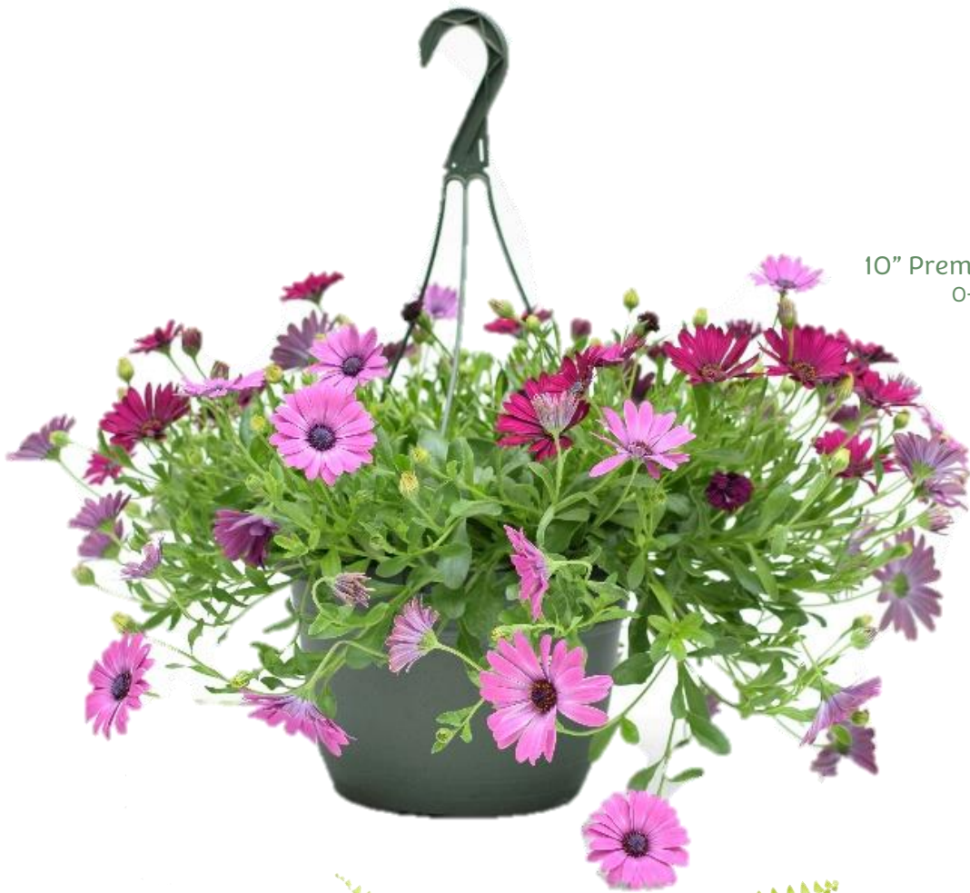
10" Premium Hanging Baskets O-54652-30026-1