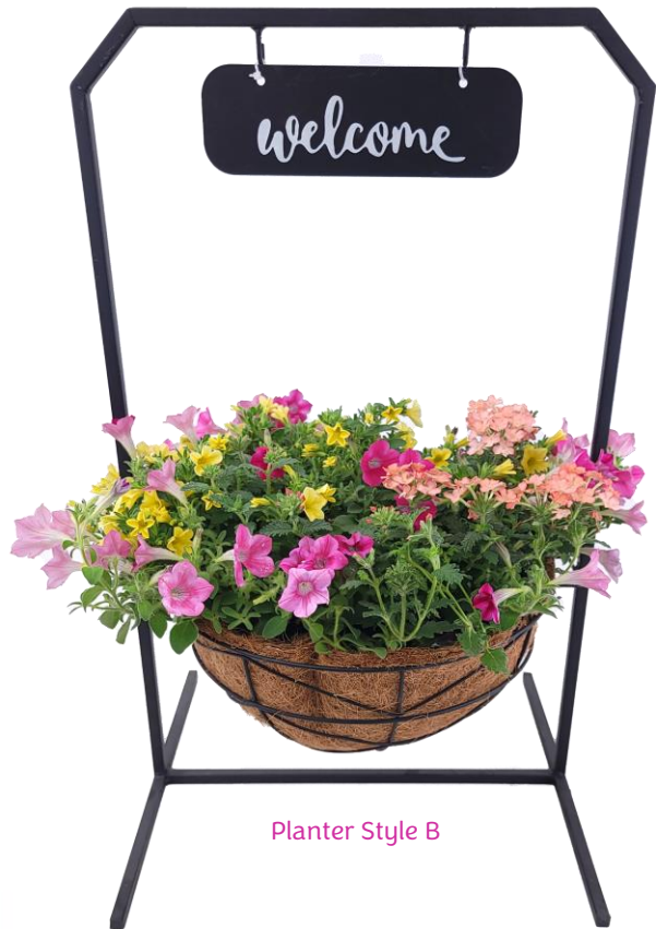
Planter Style B

*We will have both styles of planters shown below for the spring season. You may request a particular planter style or a combination of both. It will depend on availability at the time your order is pulled, as to what style you receive.