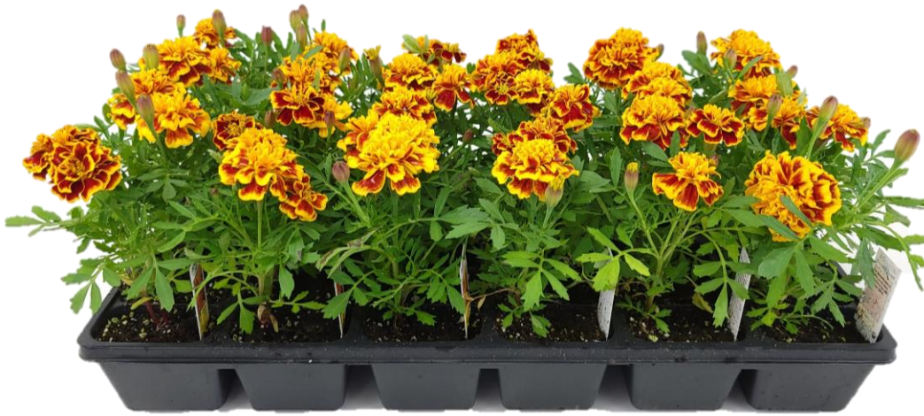
12-03 Flowering Flats Assorted: 1-88614-00002-6 Begonias: 1-88614-00006-4