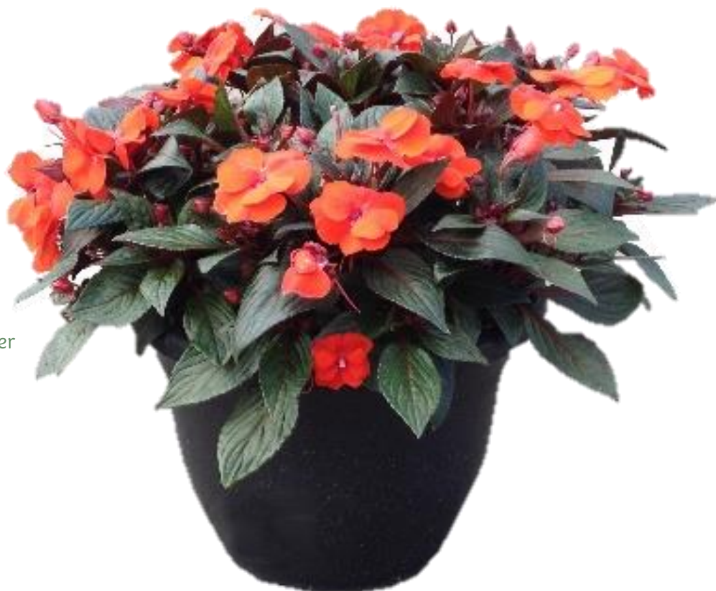
12" Sunpatien Planter 0-54652-99850-5