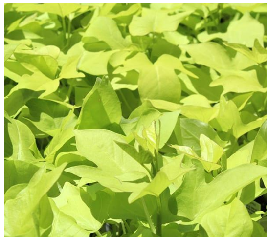
4" Sweet Potato (Ipomoea Batatas) O-54652-10800-3