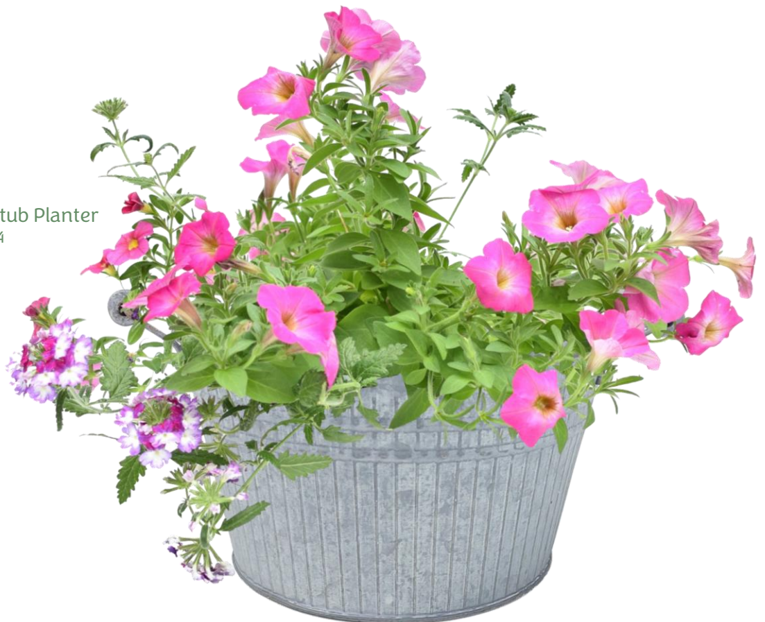
8" Flowering Petite Washtub Planter 0-54652-10720-4