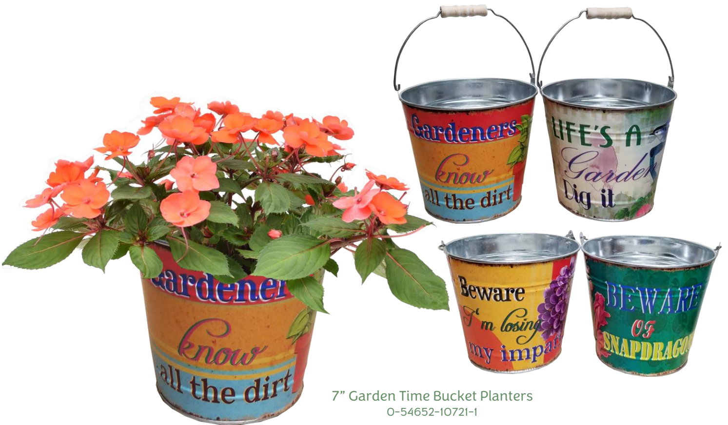
7" Garden Time Bucket Planters 0-54652-10721-1