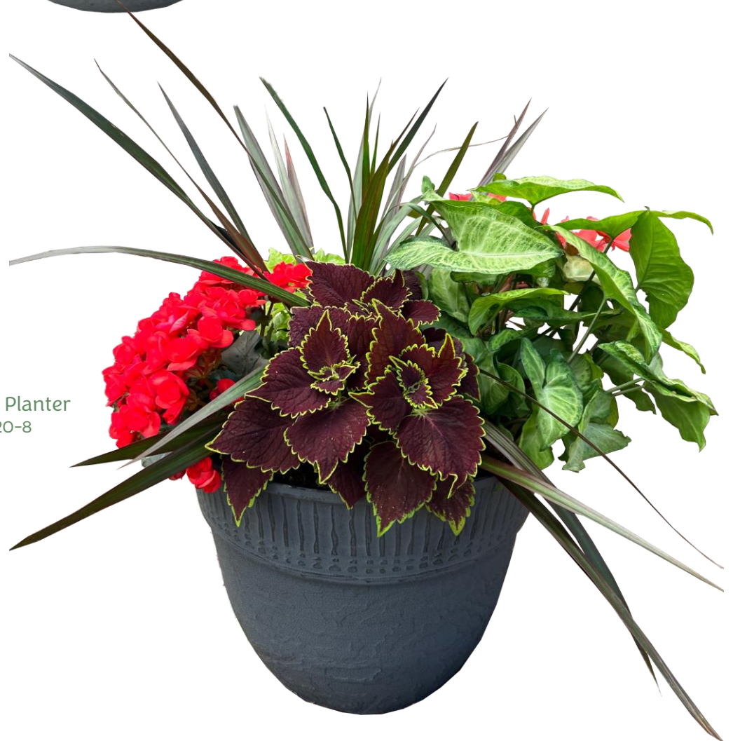
16" Combination Planter 0-54652-99820-8