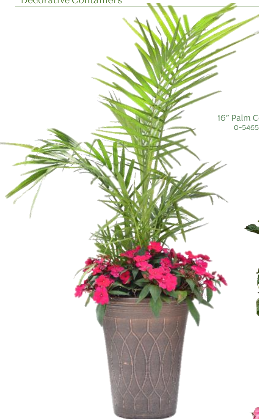
16" Palm Combo Planter O-54652-99745-4