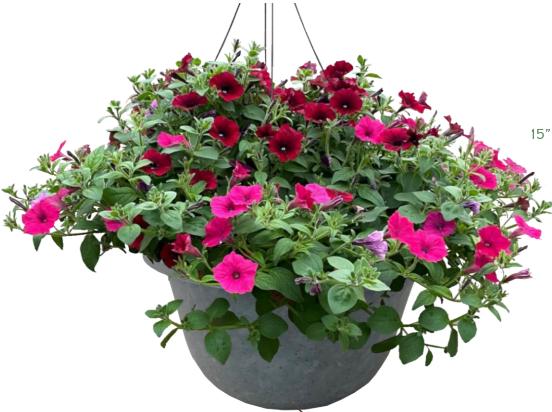
15" Combo Hanging Basket 0-54652-10620-7