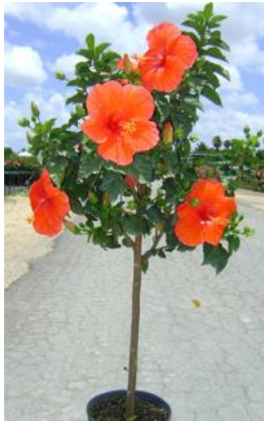
10" Braided Hibiscus Tree 0-54652-99684-6