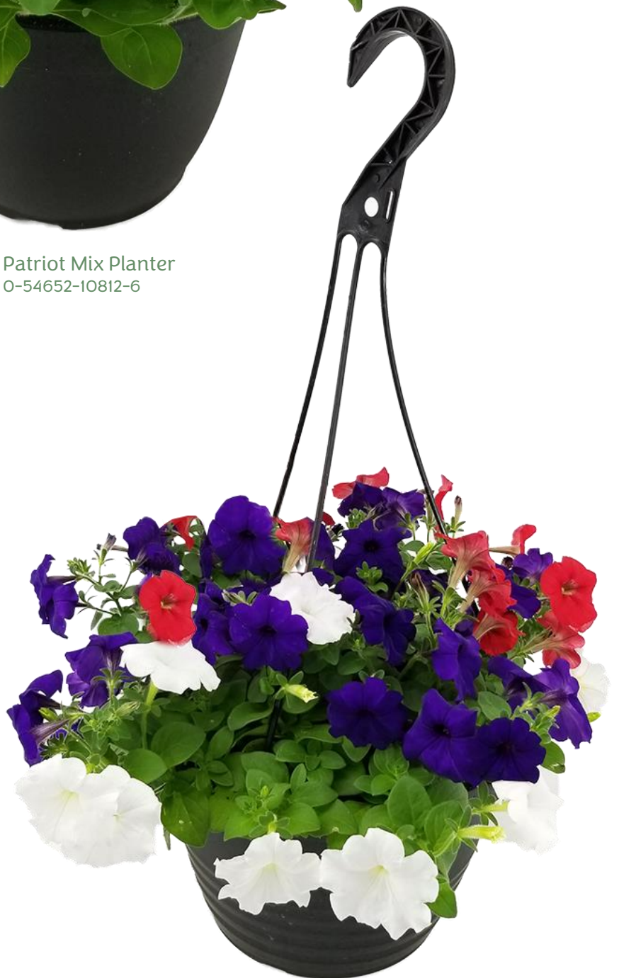
10" Patriot Mix Basket 0-54652-10344-2