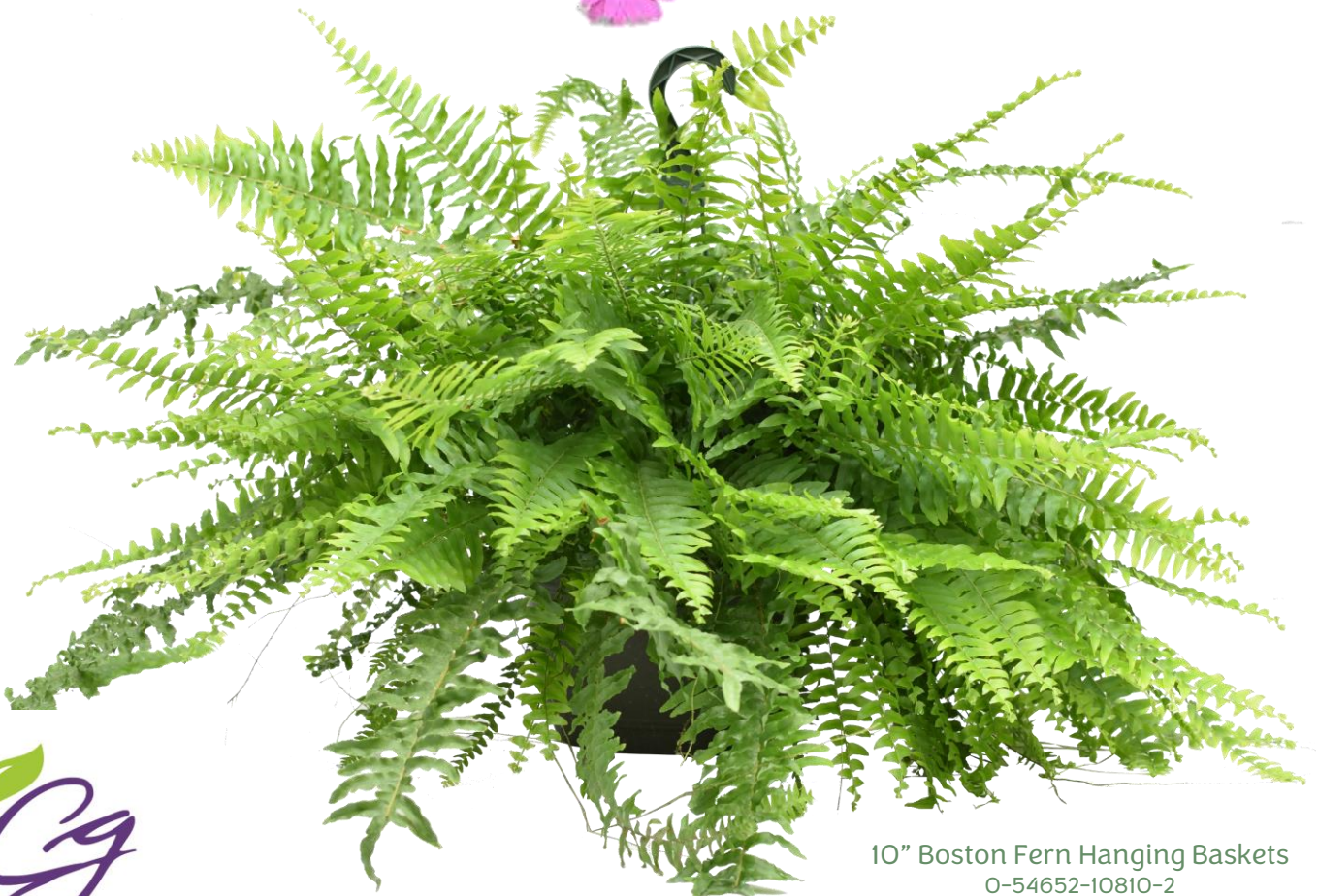
10" Boston Fern Hanging Baskets O-54652-10810-2