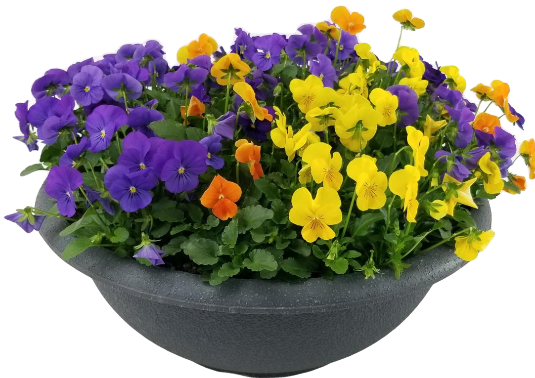
16" Viola Color Bowl 0-54652-10629-0