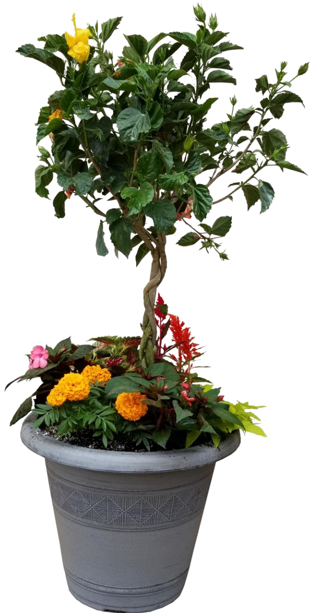
18" Combination Planter O-54652-99852-9