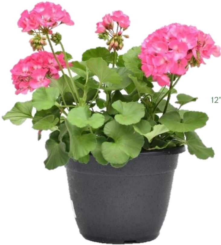
12" Zonal Geranium Planter O-54652-10819-5