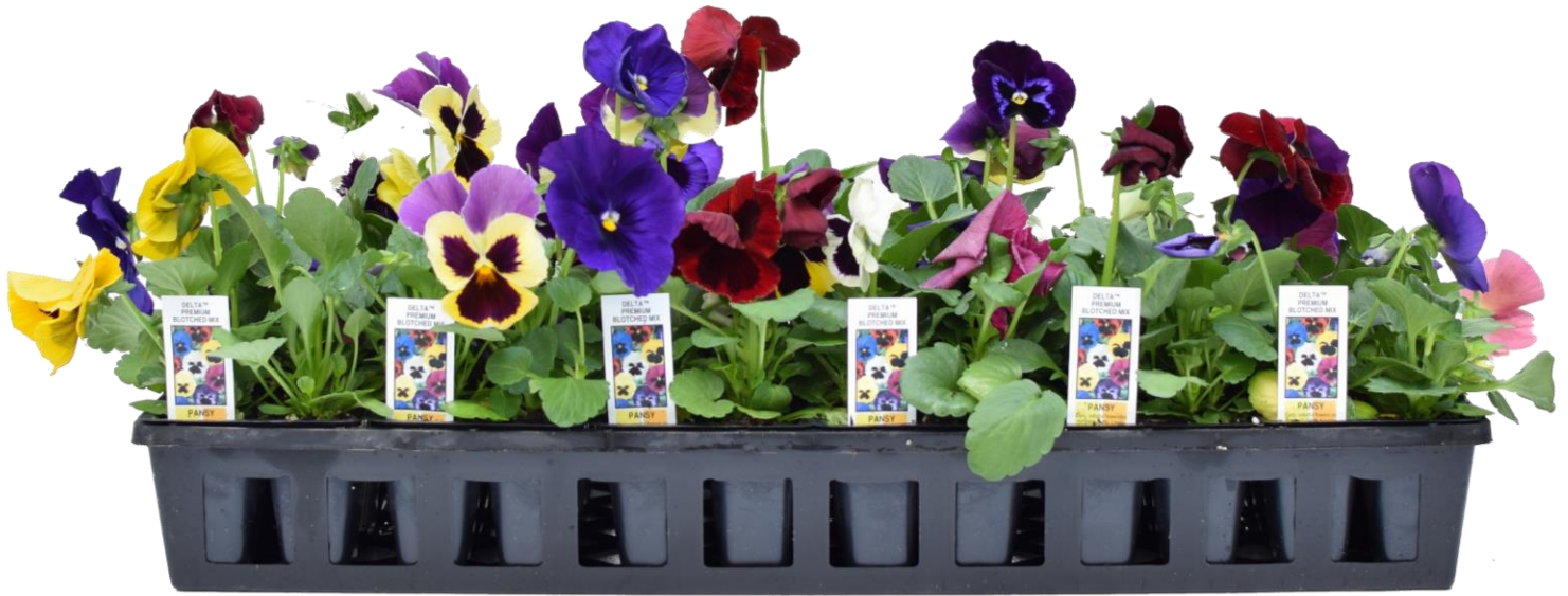
12-03 Pansy Flats 0-54652-10766-2