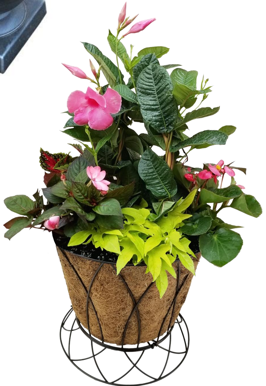
14" Wire Urn Combo Planter 0-54652-99805-5