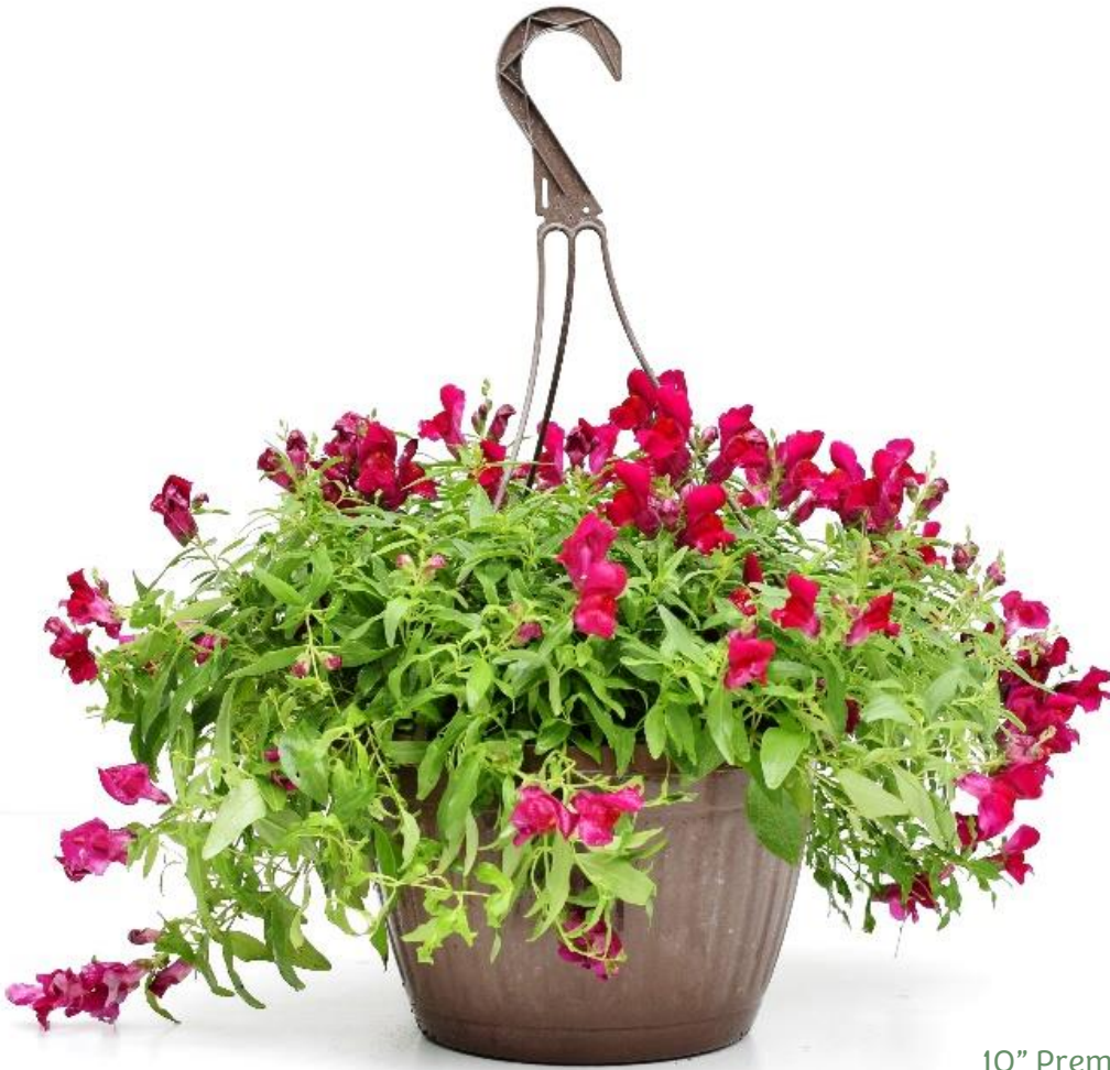
10" Premium Hanging Baskets Cool Varieties O-54652-30026-1