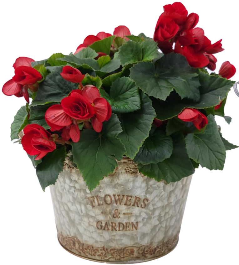
11" Begonia Garden Planter O-54652-10873-7