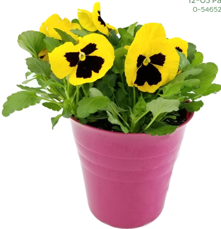
6.5" Pansy Planter 0-54652-10806-5