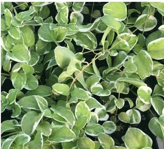
4" Vinca Vine O-54652-10801-0