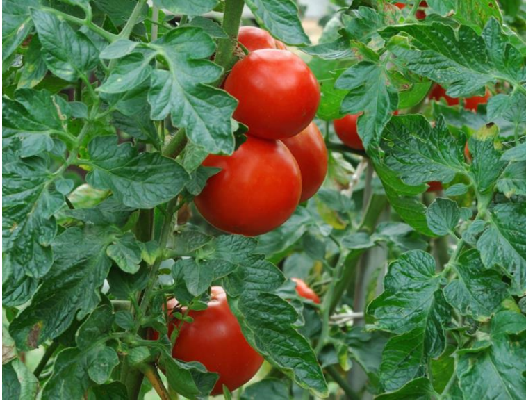
12-03 Tomato Flats 1-88614-00002-6