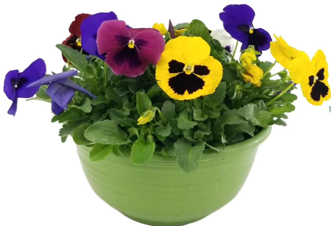
10" Pansy Color Bowl O-54652-99568-9