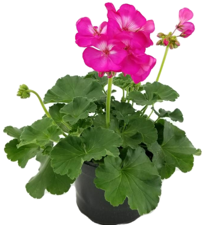
6.5" Geraniums 0-54652-10772-3