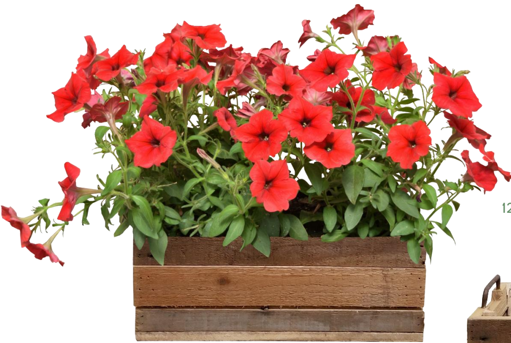
12" Flowering Wood Crate Planter O-54652-99999-1