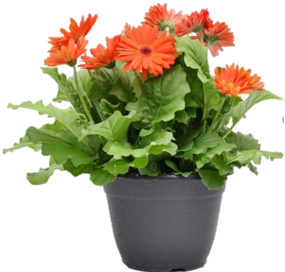
12" Gerber Daisy Planter 0-54652-10435-7