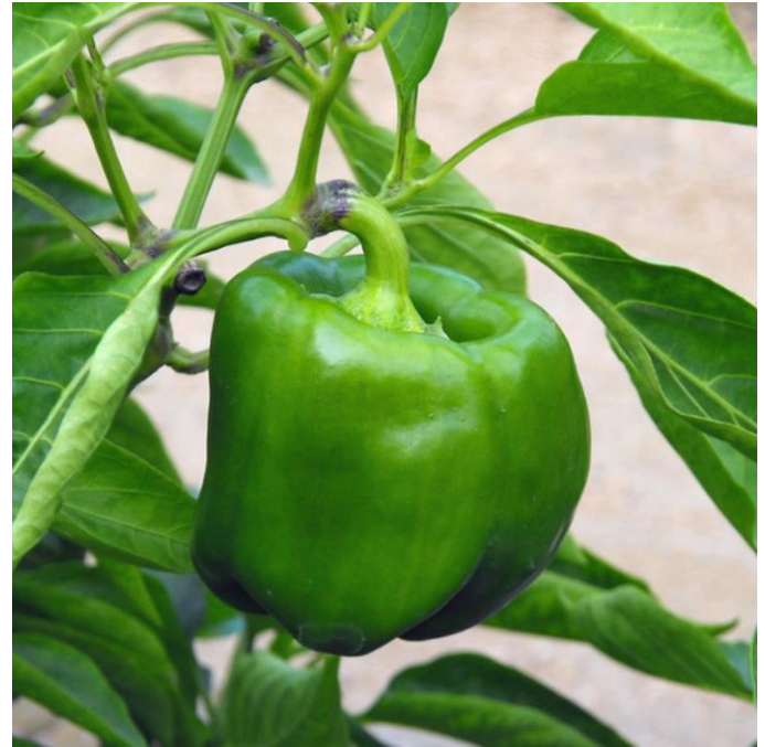
12-03 Pepper Flats 1-88614-00002-6