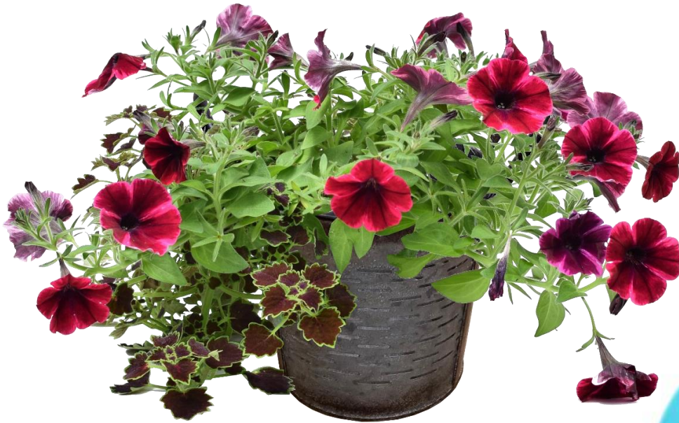
6" Combination Olive Planter 0-54652-99996-0