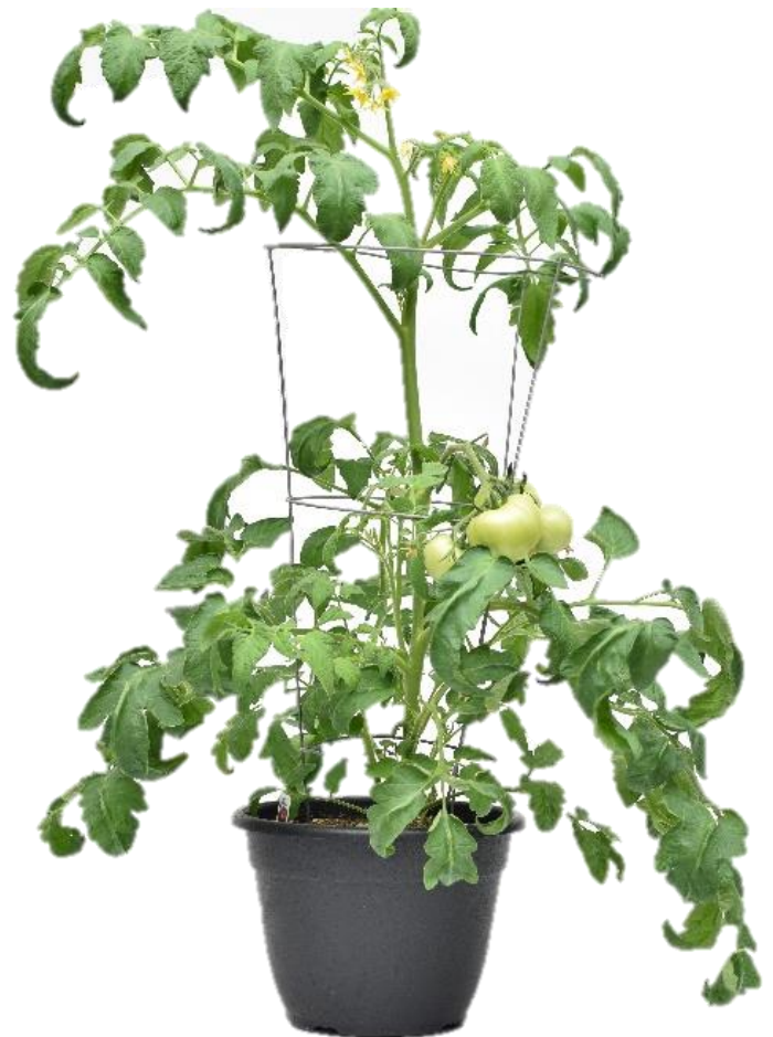
10" Patio Tomato O-54652-10813-3