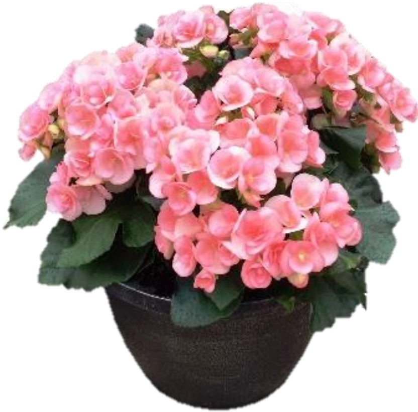
12" Rieger Begonia Planter 0-54652-99854-3