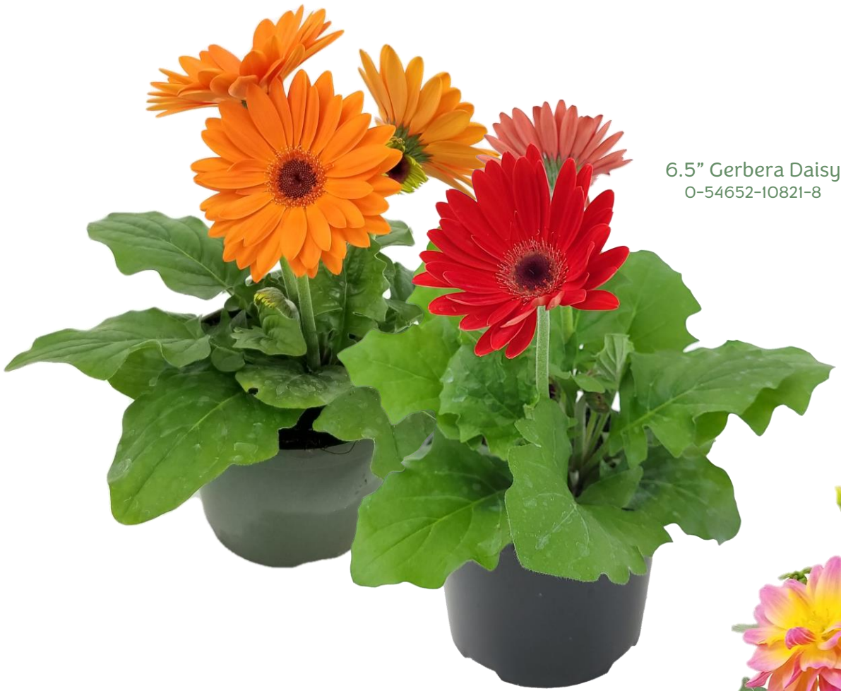
6.5" Gerbera Daisy 0-54652-10821-8