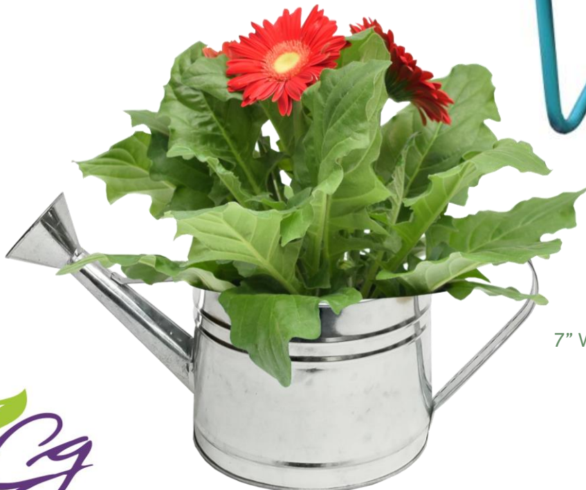
7" Watering Can Planter 0-54652-99639-6