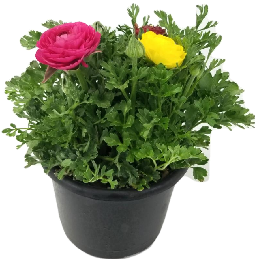
12" Ranunculus Planter O-54652-10658-0