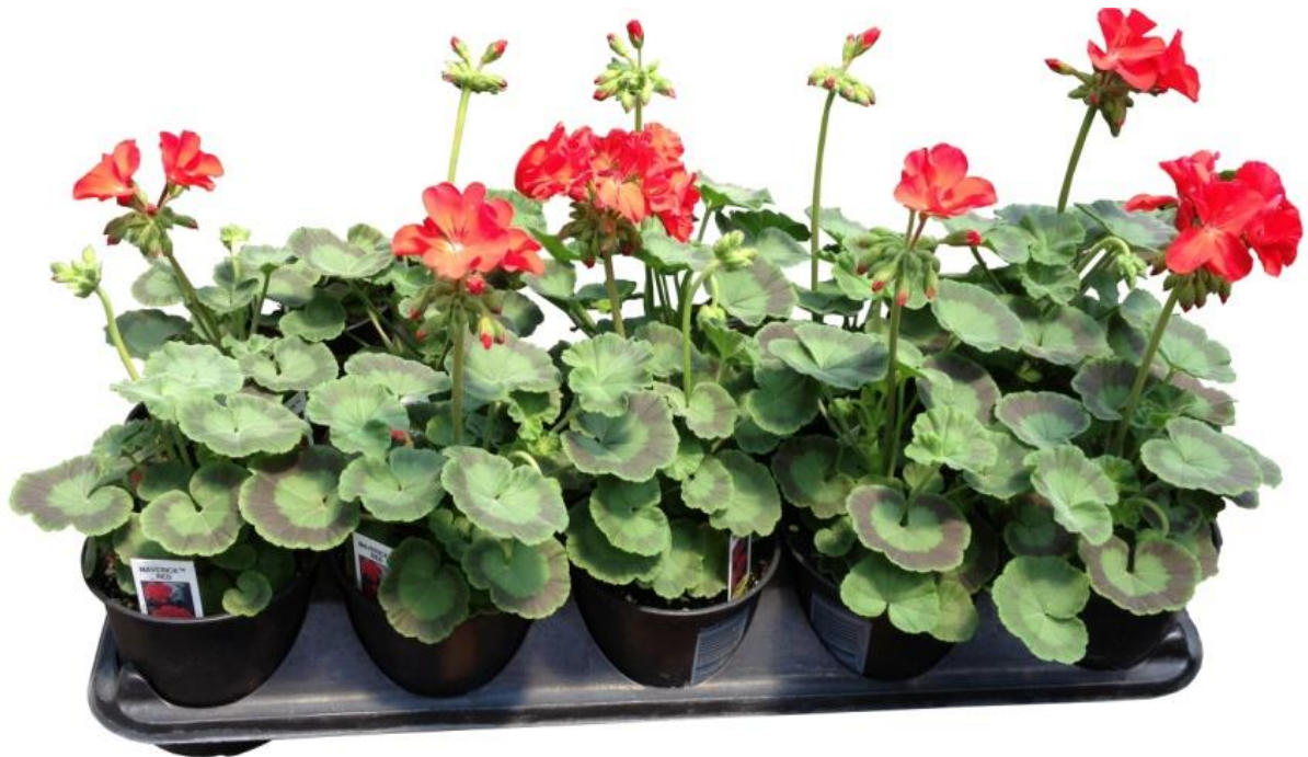
4" Geraniums 0-54652-10803-4