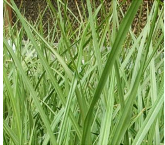
4" Dracaena Spikes O-54652-10798-3