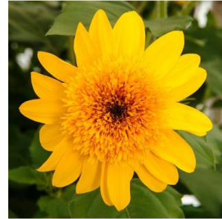
8" Sunfinity Double Sunflowers (Actual bloom shown above) O-54652-10807-2