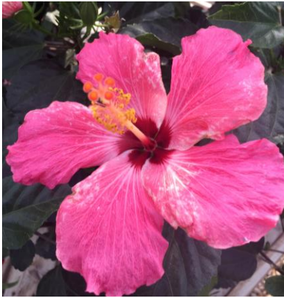
10" Hibiscus Tradewinds Assorted 0-54652-99682-2