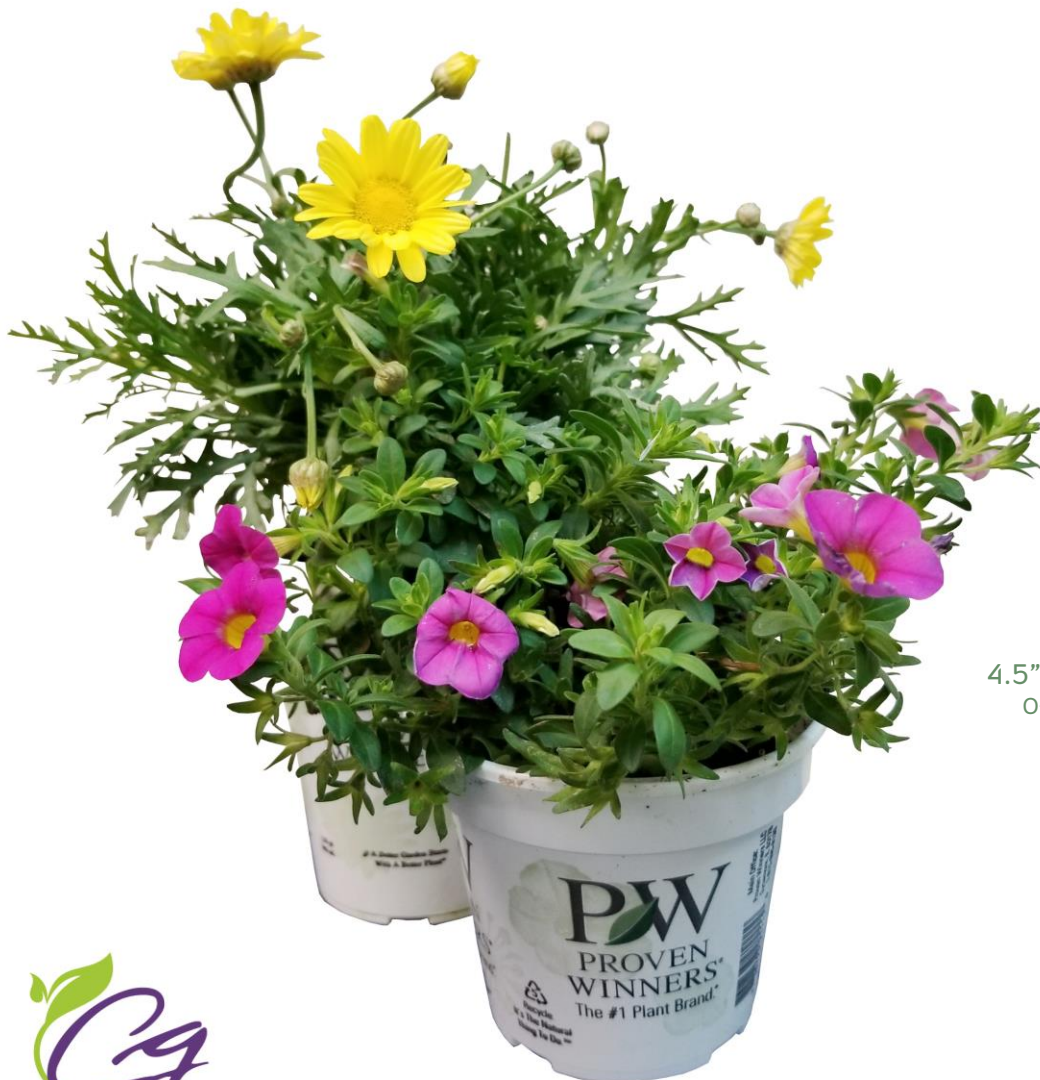
4.5" Proven Winners 0-54652-10767-9