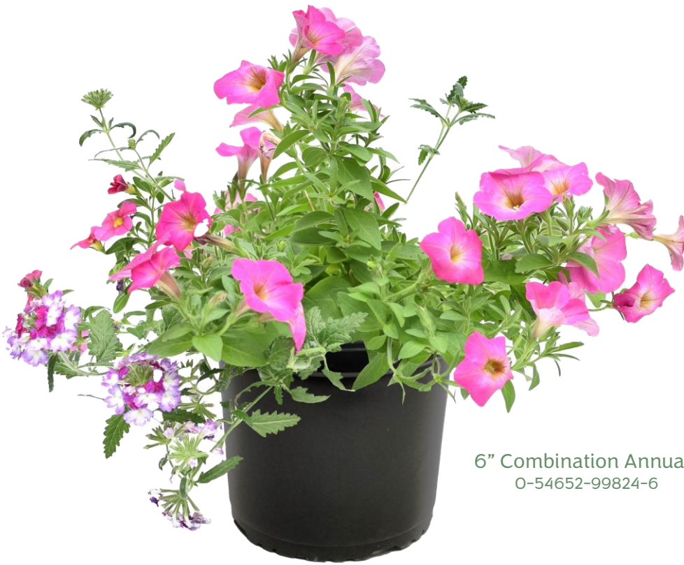
6" Combination Annuals 0-54652-99824-6