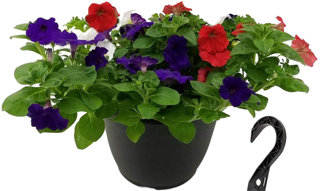
10" Patriot Mix Planter 0-54652-10812-6