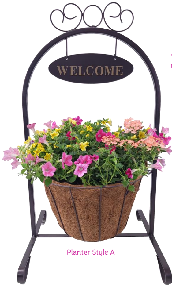
Planter Style A