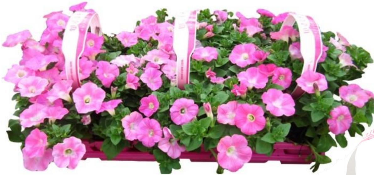
1 Flat = 3 packs